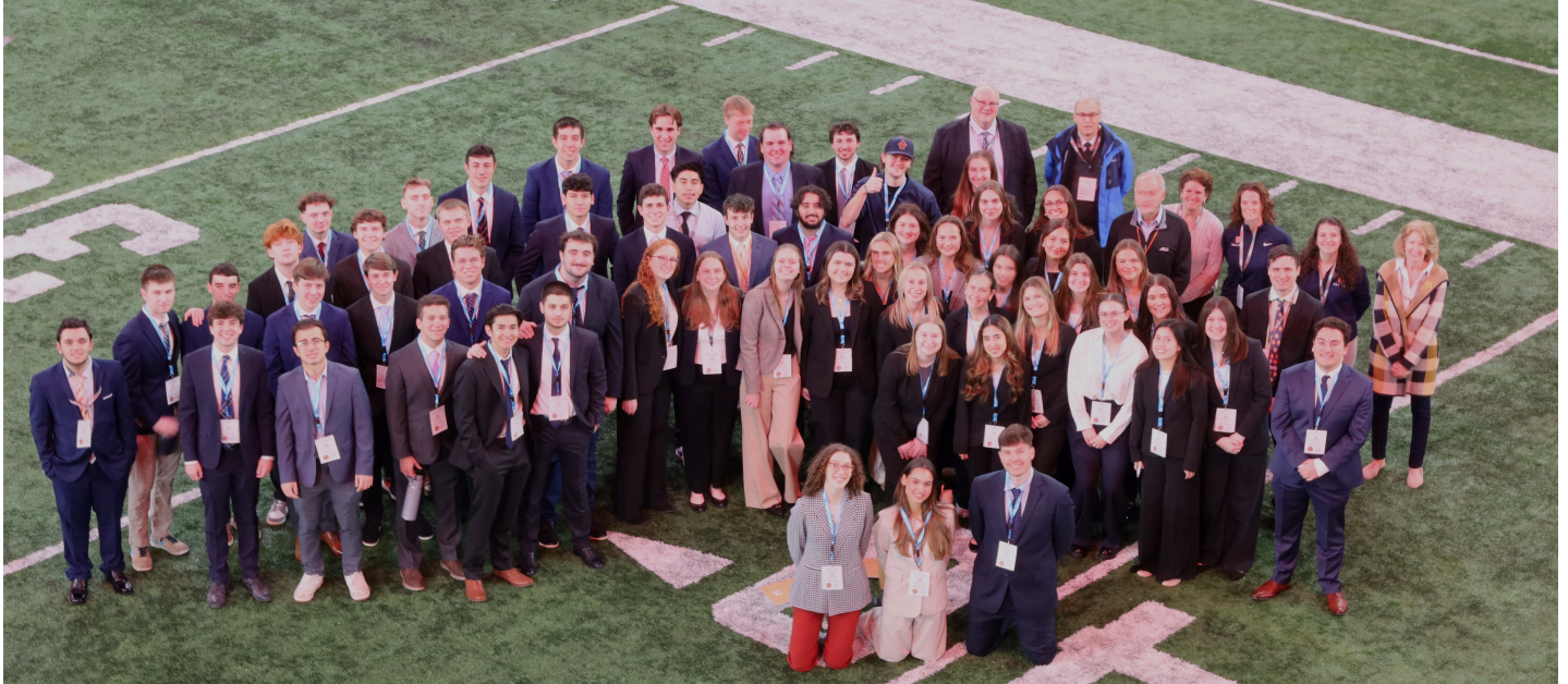
The Sport Management Club at the 20th Annual Charity Sports Auction Supporting Rescue Mission.